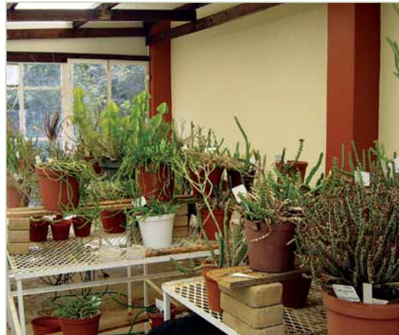
Fig. 6: Remnants of the live collection accumulated by Leach and still maintained in the herbarium

KIMBERLEY, M.J. (1996): Leslie Charles Leach 1909-1996. Plantarum succulentarum botanicus insignis . Excelsa 17: 79-87