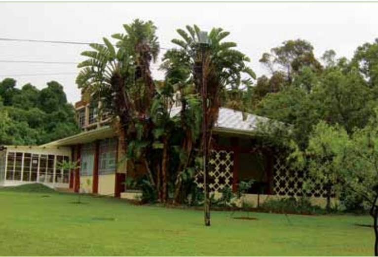
Fig. 2: The herbarium at the University of Limpopo, South Africa

collection” as it is preserved in the herbarium at the University of Limpopo. Because our main interest is in Euphorbia and the largest part of the collection is from this genus, we shall focus on the euphorbias only, but the reader should keep in mind that there is quite a bit of information about stapeliads and aloes as well, especially slides and photographs.