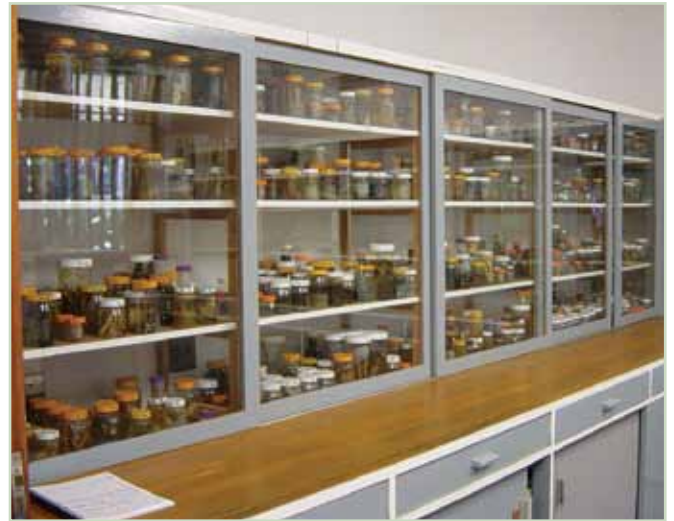
Fig. 3: The spirit collection at the University of Limpopo contains over 1,000 samples of collected Euphorbia material

In addition there are 638 dried and pressed, but unlabelled samples. It is turning out to be quite a task to curate these so that they can become a permanent part of the herbarium material. The herbarium also has a substantial number of the booklets that Larry used to document his collection notes and observations. In total there are 18,025 identification numbers in his notes and we have found entries 9,276 to 18,025