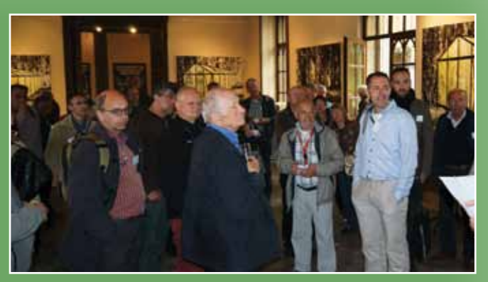
Participants waiting to be grouped for their guided tour through the greenhouses and collections.