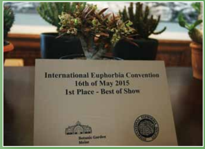
A specimen of the true E. suzannae-marnierae Rauh & Petignat won its owner the first prize for the most beautiful Euphorbia in contest.