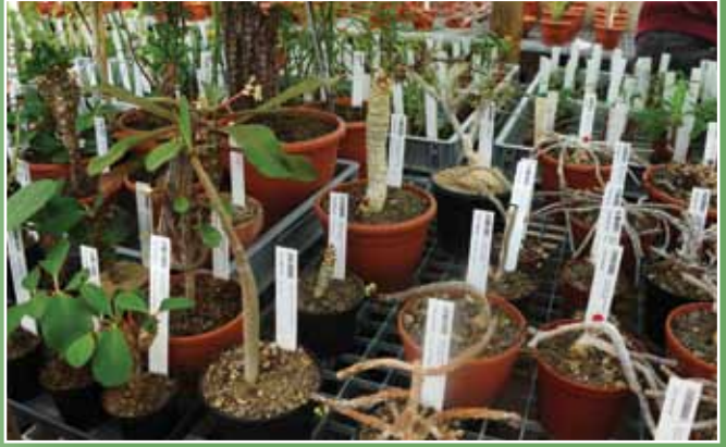
The Euphorbia collection — usually not open to the public — is a dream come true for every lover of Euphorbia.